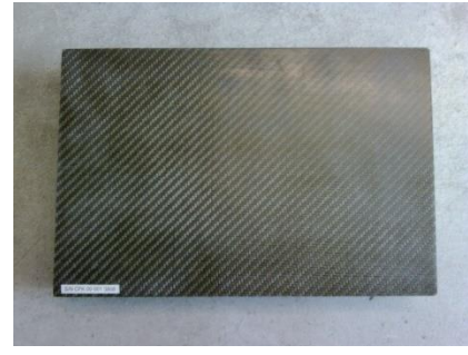
Carbon fiber composite

Every year, the aerospace and materials industries create new and impressive innovations. Driven by a desire to reduce weight, increase performance, and improve bottom-lines, aircraft designers are relying on more advanced materials and composites to build airframes and interiors. So far 2015 has been no exception to this trend, seeing new composites and coatings, sustainable sourcing of materials, and progressive lightweight designs.